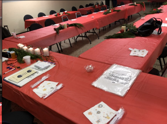
The view from the chair.