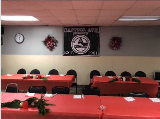
The meeting room, with the banner